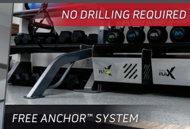
FREE ANCHOR™ SYSTEM